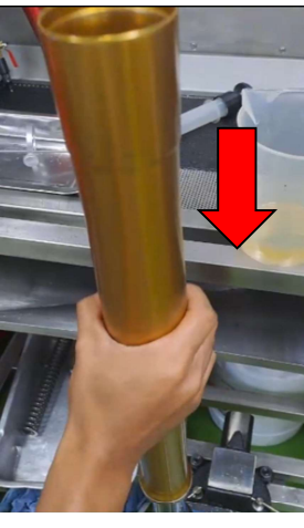
9. Oil volume according to the table below, then install the YSS SPRING.